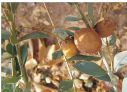
Figure 1. Maerua pseudopetalosa fruits before harvest and seeds without their shell

The dosagees then carried out on the distillate by titrimetric referring to the standard method of the dosage of ammonium in water (Rodier, 1996). The equations that take place during the dosage are as follow: