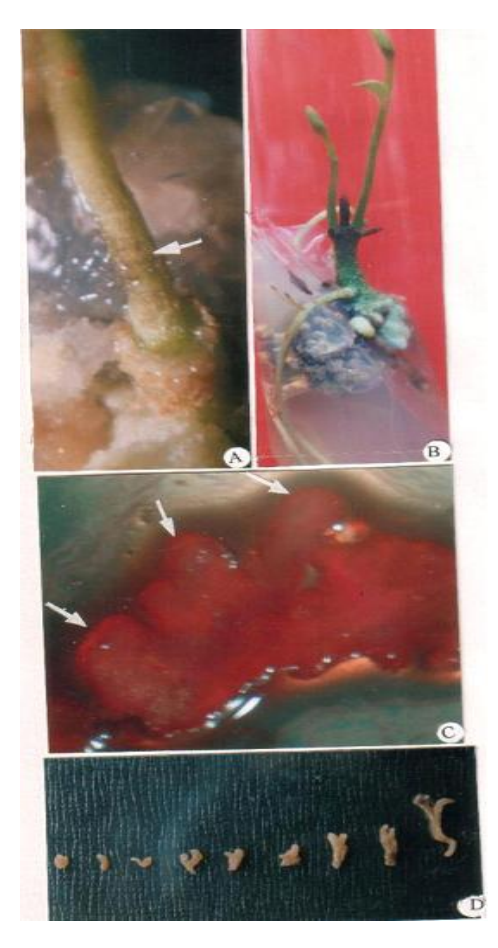
Figure 2. Germination and conversion of somatic embryos in Celastrus paniculatus Willd