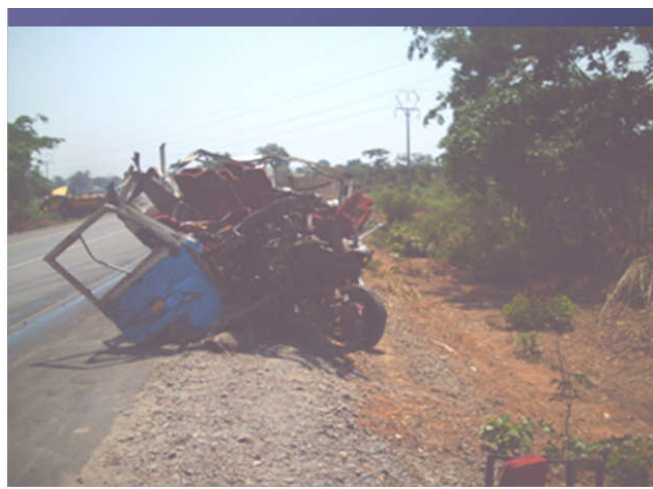
Figure 4. T3 Road Accident