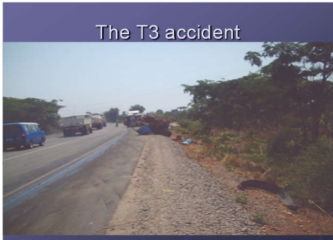
Figure 3. The T3 Road Accident