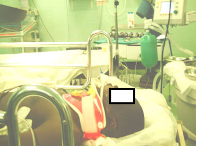
Figure 7. Head Injuries Victim

In most cases people were doing what they were expected to do, there was little confusion and panic. Later on the administrative staffs were also mobilized to attend to administrative issues which arose like transport, issuing of necessary materials and looking after the care givers<sup>4</sup>. It is our belief that the death toll would have been higher if we had been caught unawares. As it is only one patient died of a potentially survivable condition. The issue here is that we in developing countries can manage these incidents just like anywhere else if we put in place measures like a disaster plan document and carry out drills. This will attune our medical personnel to the idea of handling medical/surgical emergencies in a calm non panicky way. Most modern hospitals have made it their policy to write Disaster plans and carry out Disaster drills or simulations to prepare for these disasters<sup>2</sup>. Although this is the trend nowadays most health workers learn about mass casualty management by being caught in a mass casualty incidence without preparation (Patkus and Motylewski, 2007). In our case the results speak for themselves; This was a high impact accident looking at the number of people that died at the scene of the accident -14 out of the total mortality of 19, however of those that were taken to the hospital alive only three died; two had injuries not compatible with survival only one died of a potentially preventable condition the others