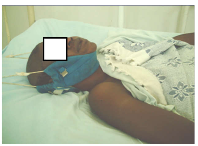
Figure 5. RTA Neck Victim

event disaster because of our having two very busy stadiums in our two towns-Chingola and Konkola, a public health disaster because we live in a developing country with the attendant public health issues and of course a road traffic disaster because of our position sitting at the intersection of the three major routes on the Copper belt. True to Murphy's Law one of these anticipations happened on the night of the 6th of October 2007. The quick mobilization of the medical staff was possible because of previous drills we had.