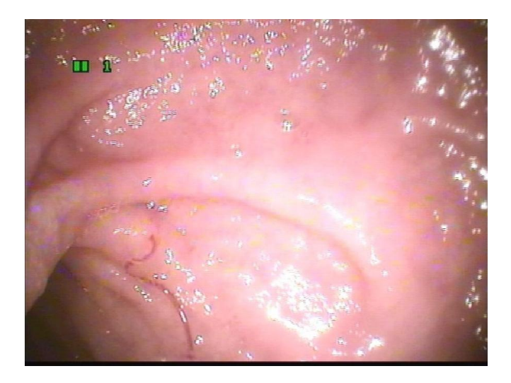
Fig. 2. Single hookworm in duodenum in apatient with its benthead and S-shaped appearance with mildanaemia (haemoglobin 11.7 g %) and with eosinophilia (absoluteeosinophil count– 870 cells/cu.mm)