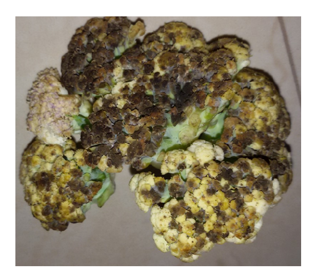
Image 1. Cauliflower head infected with Alternaria brassicicola causing head rot disease