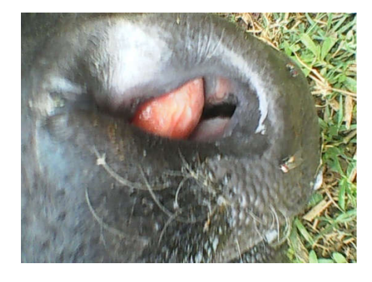
Fig. 1. Nasal granuloma affected cow

Department of Surgery and Radiology and Department Parasitology, Bihar Animal Science University, Patna