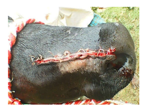
Fig. 2. Many growth of nasal granuloma removed and sutured nasal passage

In the upper part growth was removed manually. Potash gauzes was used to press the bleeding. Injection Botropase was also given. Muscle was sutured with sutured with chromic catgut no. 2. Skin was sutured with silk thread. Antibiotic