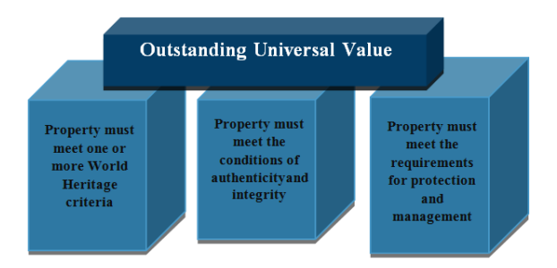
Figure 2. Three foundation for a property to be judged as of Outstanding Universal Value (Source: World Heritage Resource Manual, 2011).