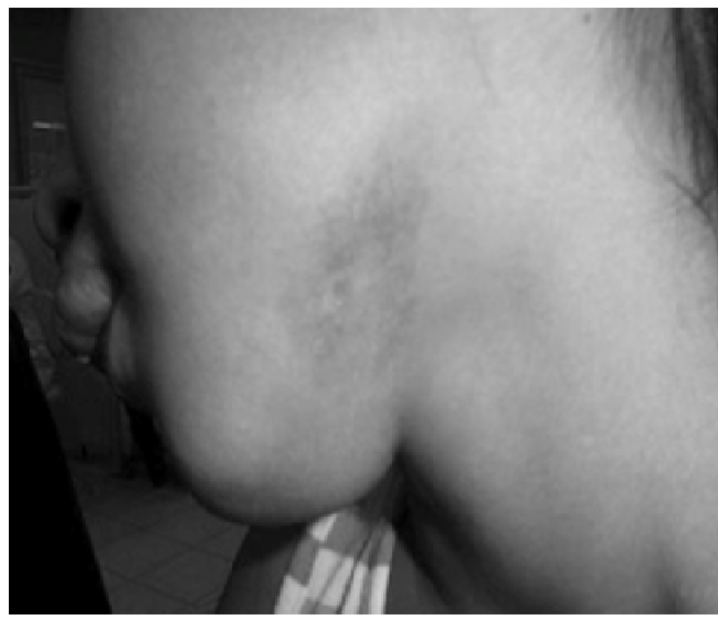
Fig. 5. Fistula lesion 1 and 3 weeks after exodontia of 36

professionals who treated her. Continuous control of the patient's systemic and oral situation in Piauí was recommended. It was observed, therefore, that the fistula completely regressed and lip edema regressed significantly after treatment of the patient's dental condition and removal of the infectious focus represented by the fistula.