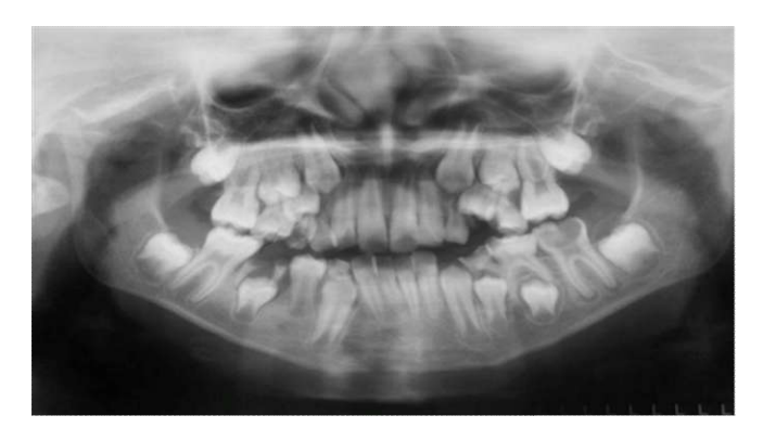
Fig. 1. Panoramic radiography: tooth lesion 36