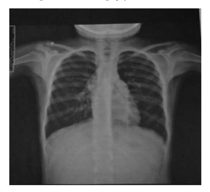
Fig. 2. Chest radiography: dextrocardia

fibrous consistency, besides having fissured areas, which caused discomfort to the patient. Its coloration was similar to that of the vermilion of the inferior lip (Fig. 3). The first diagnostic hypothesis was leishmaniasis, due to the region of origin, where the dwelling region is an endemic zone in Brazil. The Reaction from Montenegro test was then requested, which turned out to be negative.