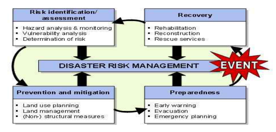
Fig. 1. Disaster Risk Management Model