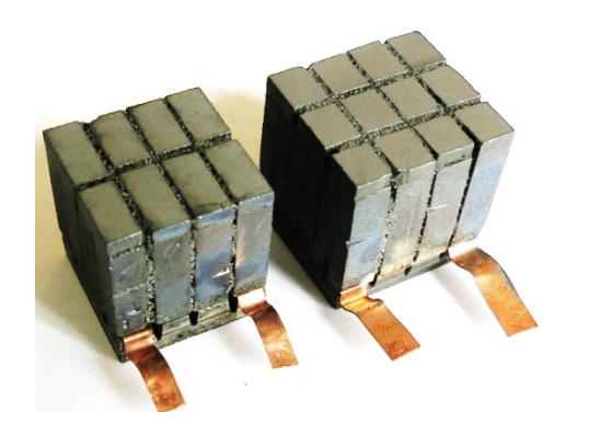
Fig. 2. Photos of modules from 16(2.0x2.0x2.3 cm) and 24 (2.2x2.2x2.3 cm) branches

Monolithic thermoelectric module: Graphite switching plates were attached to the ends of the alloy branches. The switched sample was placed in the vacuum chamber of an induction furnace, and probes were placed in its switching plates to measure the temperature and electromotive force. One side of the module was heated by a flame generated by gas combustion, which directly hit the surface of the module. On the other side, the module was cooled by running water. Chromel-alumel thermocouples were placed on the hot and cold ends of the module. The monolithic thermoelectric module's cold side electrical insulation node was fabricated using AlN and graphite plates. Both of them are thermomechanically combined with SiGe alloys in a wide temperature range, which is very important for creating a thermostable TEG. Figure 2 shows photos of modules from 16 and 24 branches.