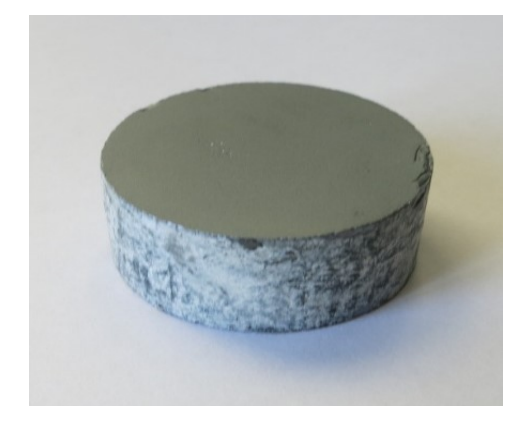
Fig.1. Photo (x1) of briquette compacted from ultradispersedSi<sub>0.7</sub>Ge<sub>0.3</sub>+P<sub>0.5</sub> (wt.%) alloy powder at 1300°C

samples were cut out on a diamond-cutting disk device. Photo of briquette is shown in Fig.1.